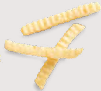
Crinkle Cut 1/2" 6/5lb SKU: 10071179048350