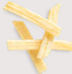
Tin Roof Cut 6/5lb SKU: 10071179048374