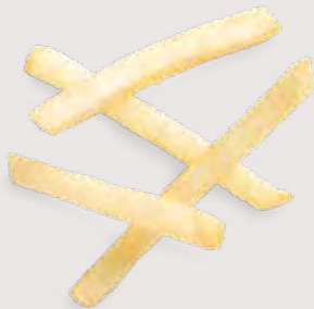
Straight Cut Fries 3/8" 6/5lb SKU: 10071179043386