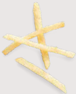
Shoestring 1/4" 6/4.5lb SKU: 10071179043416