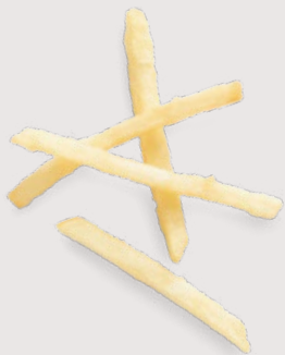
Shoestring 1/4" 6/4.5lb SKU: 10071179043416