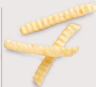
Crinkle Cut 1/2" 6/5lb SKU: 10071179048350