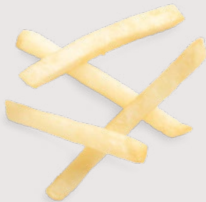
Straight Cut Fries 3/8" 6/5lb SKU: 10071179043386