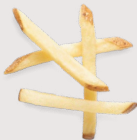
Straight Cut, Skin On 3/8" 6/5lb SKU: 10071179048336