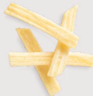
Tin Roof Cut 6/5lb SKU: 10071179048374