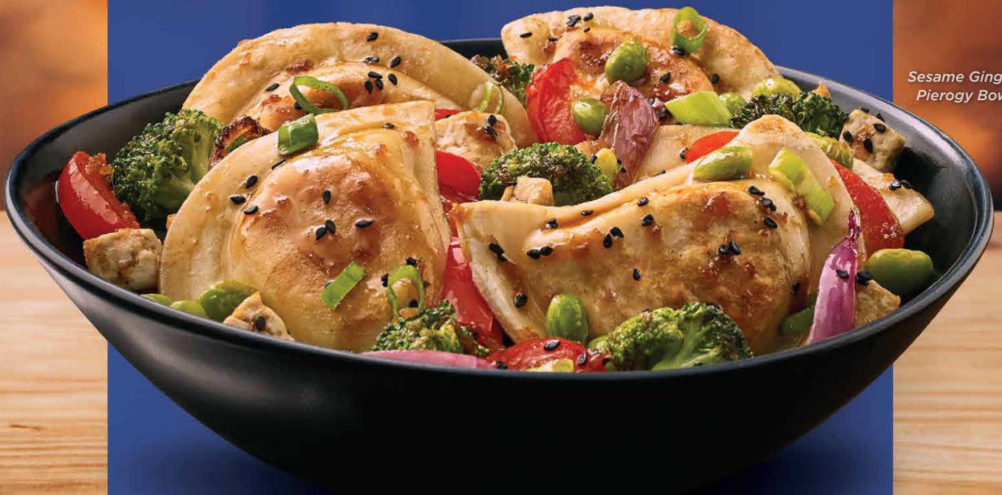
Sesame Ginger Pierogy Bowl

Give your customers the menu variety they are looking for during the Spring. Mrs. T's Pierogies are not only an easy-prep meatless menu option, they're highly profitable and a hearty, delicious addition to any part of your menu.