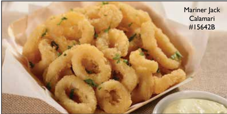
Mariner Jack Calamari #15642B

Deep fry at 350 degrees for 1 ¾ - 2 minutes or until golden brown