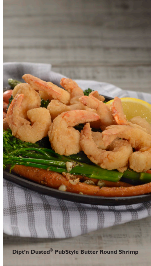
Dipt'n Dusted® PubStyle Butter Round Shrimp

©2021 Tampa Maid Foods LLC. All Rights Reserved. Ocean Innovations® and Mariner Jack® are registered trademarks of Tampa Maid Foods, LLC.