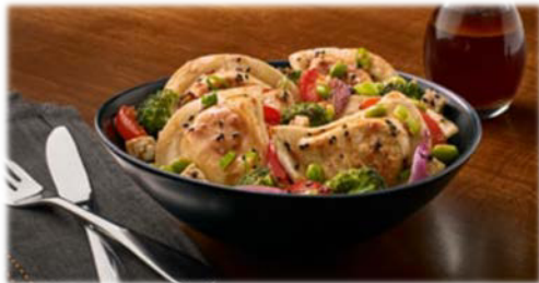
Sesame Ginger Pierogy Bowl

Takeout, Curbside, Delivery, No Problem! Serve up Comfort!