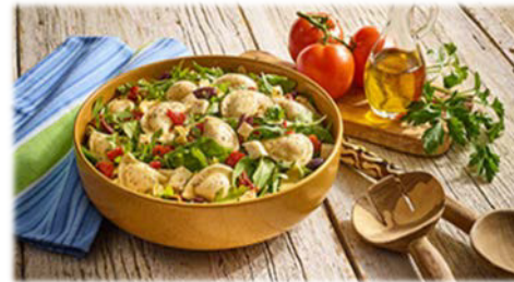
Tuscan Mini Pierogy Salad