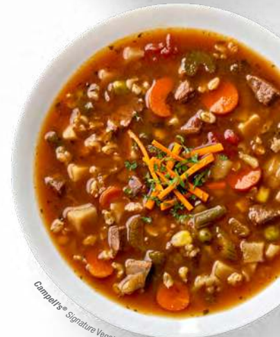
Campbell's® Signature Vegetable Beef with Barley Soup - 08163