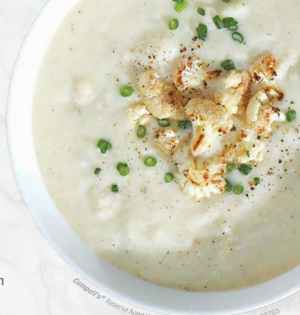
Campbell's® Reserve Aged White Cheddar & Cauliflower Bisque - 28265