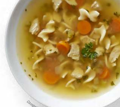
Campbell's® Signature Chicken Noodle Soup - 20303